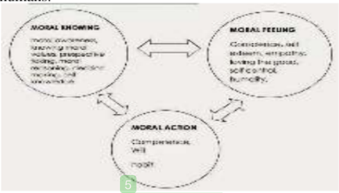
Fig. 1. The components of good character

The characters are also a device a good behavior for citizens [15]. The character is good for someone like honesty, responsibility, respect for others and other good values that can be realized in concrete actions in everyday life [16]. The pillars of character are universal consists of peace, cooperation, respect, happiness, honesty, humility, affection, responsibility, simplicity, tolerance and unity [17]. The character is a good attitude or behavior that includes honesty, courage, justice, and compassion that is owned by humans.